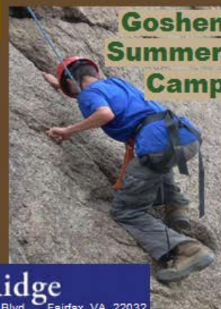
Goshen Summer Camp